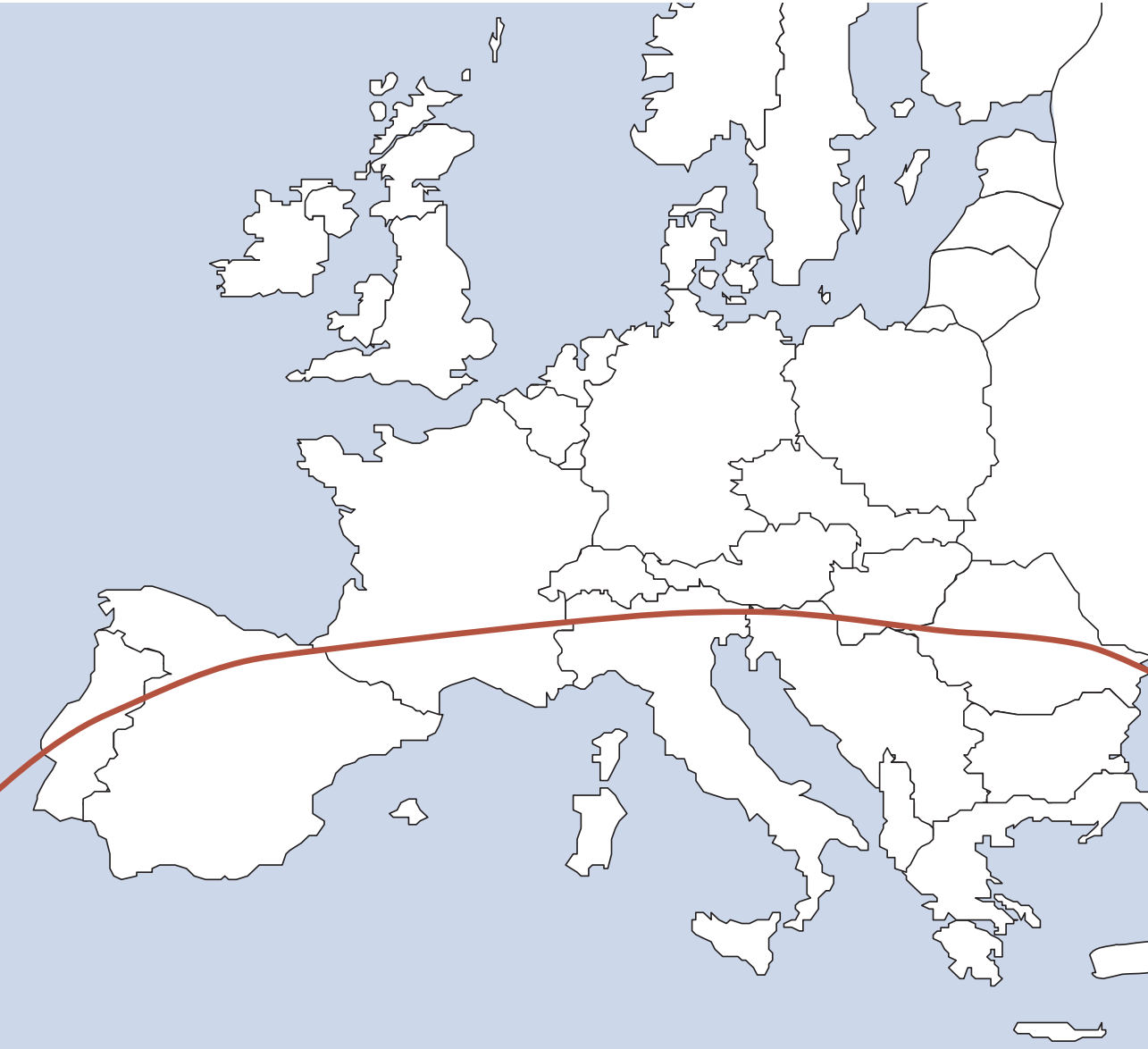
Figure 2a: Rhipicephalus sanguineus is primarily a tick of southern Europe: below the red line indicates where it occurs most frequently